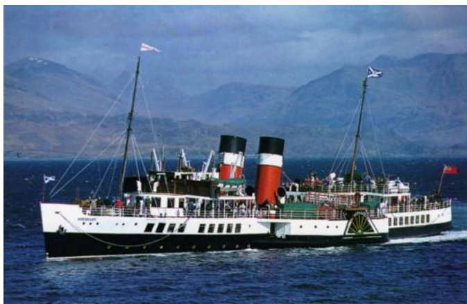
PS Waverly Paddle Steamer

P.S. The ferry still stops running at 8:00 pm every day.