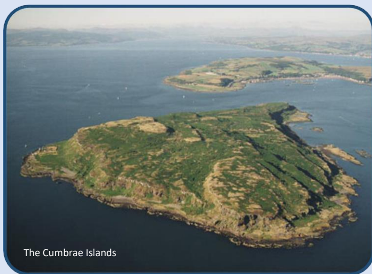
The Cumbrae Islands