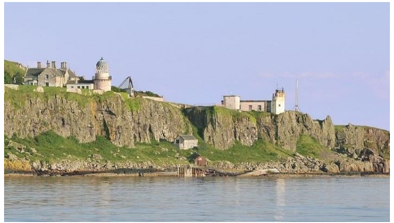
Lighthouse on Little Cumbrae